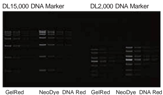
Fig 1. The results of NeoDye DNA Red and standard GelRednucleic acid gel staining

Fig 1. and Fig 2. are NeoDye DNA Red dye nucleic acid electrophoresis and cell membrane permeability assay (cytotoxicity assay), respectively.